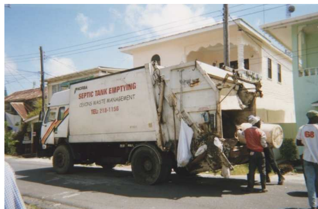
Figure 1 Collection truck with bag of sorted material

While the formal sector, namely registered enterprises such as Banks DIH and Demerara Distillers Ltd encouraged customers to return beverage bottles via retailers when making purchases the return of bottles used for packaging other food items was facilitated through the informal sector, those unregistered enterprises individuals or family owned businesses who sought to make a livelihood from such activities. The separation process while not organized by the Georgetown Municipality did serve to