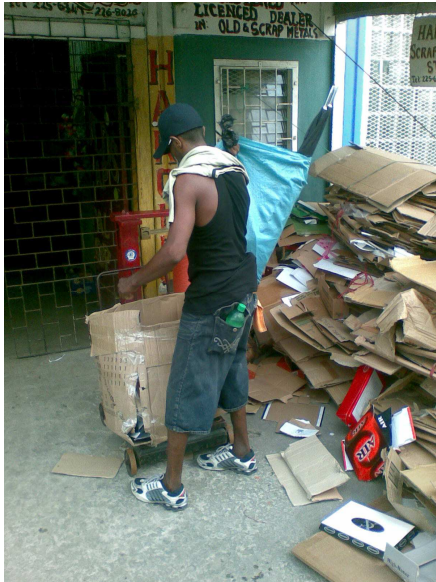
Figure 2 Street picker selling cardboard

benefit the municipality through a reduction in the quantity of waste it needed to handle, resulting in savings in expenditure and income generation for members of its community. Such was the vibrant nature of the trade in used glass bottles that even employees of the Municipality engaged in waste collection could be seen sorting the waste along the collection route to acquire the bottles.